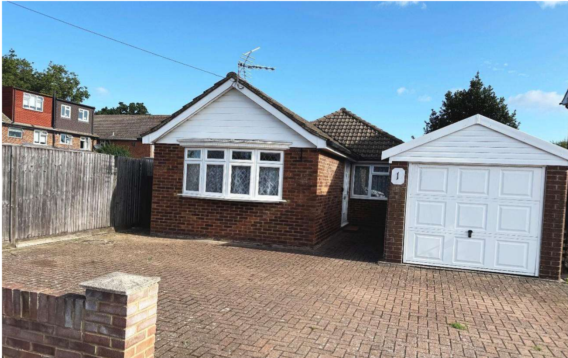
New Park Road, Ashford, TW15 1EG