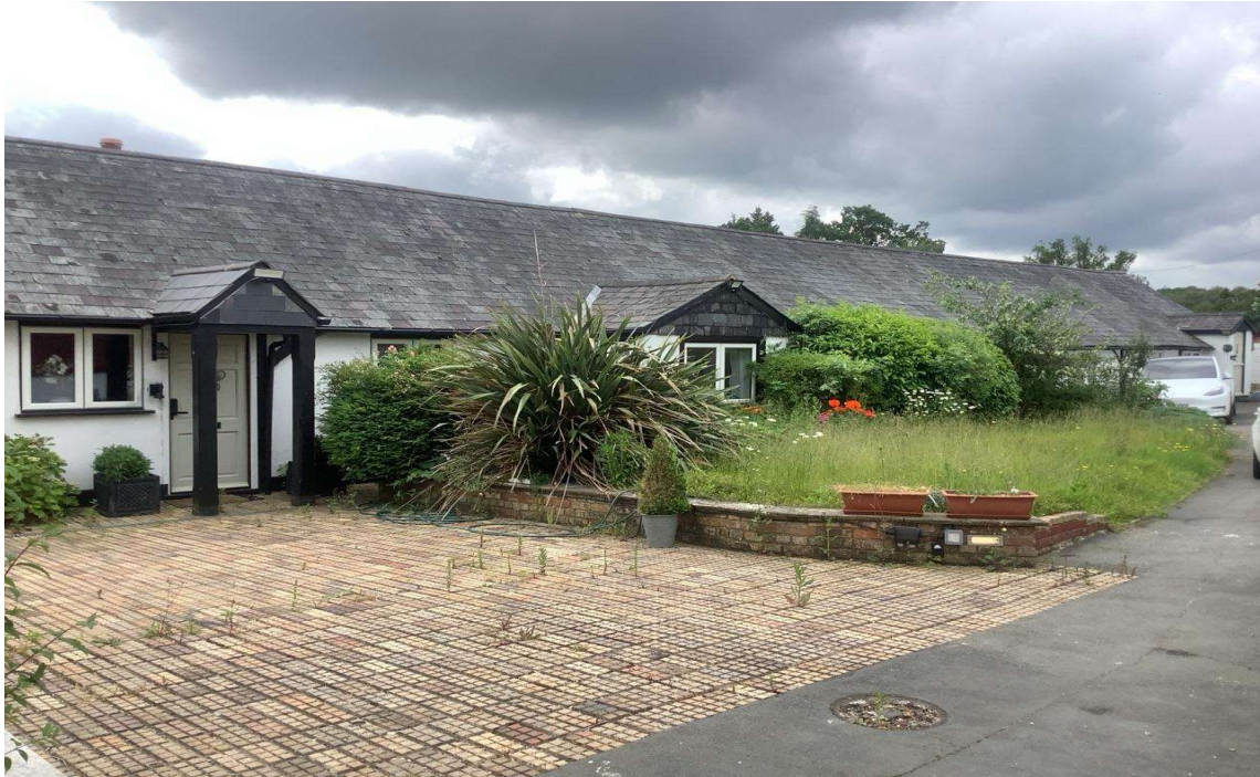
Almners Farm, Chertsey, KT16 0BH