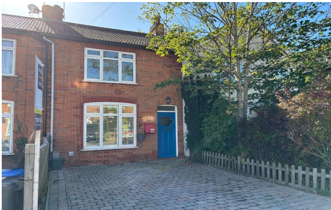
Wilson Road, Englefield Green, TW20 0QB