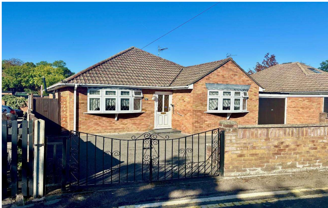
Langham Place, Egham, Surrey, TW20 9EB