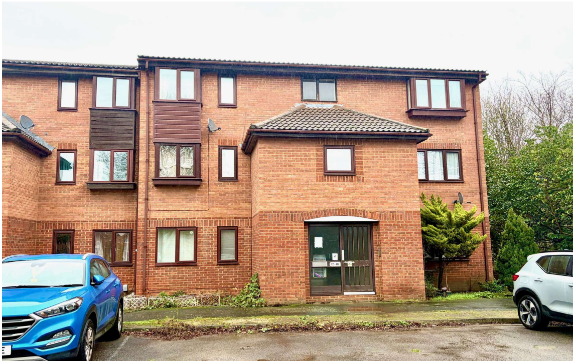
Qunicy Road, Egham, TW20 9JJ