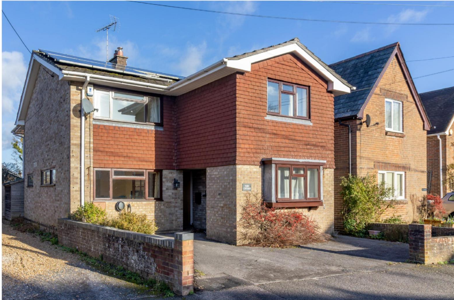
At home in Alresford