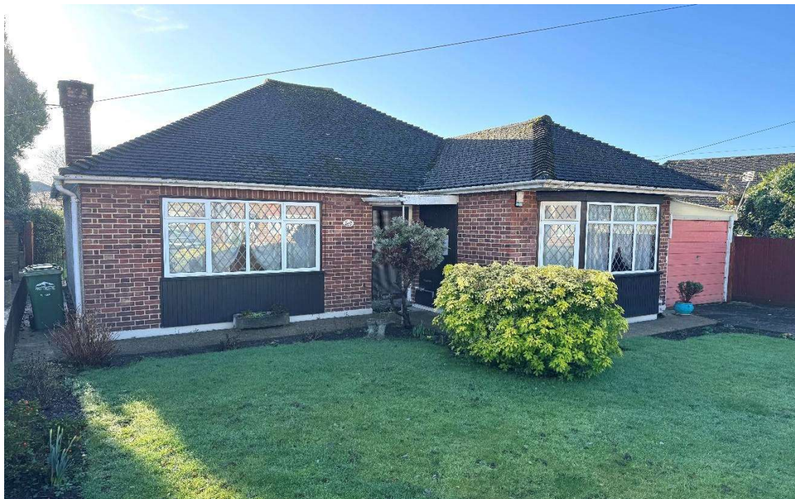
Grosvenor Road, Staines, TW18 2RW