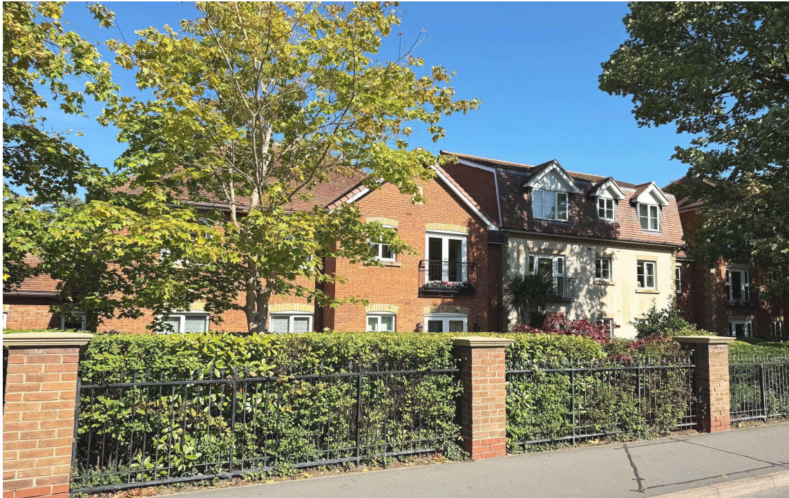
Albany Place, Egham, Surrey, TW20 9HW