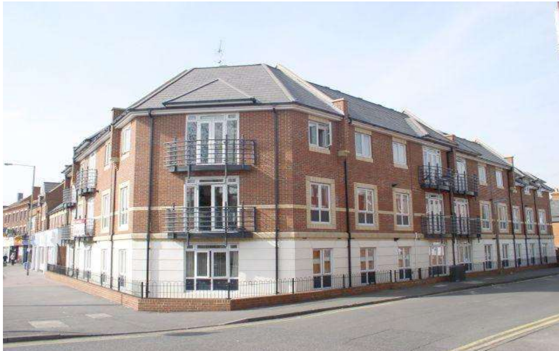
Henley Court, Egham, Surrey, TW20 9DZ