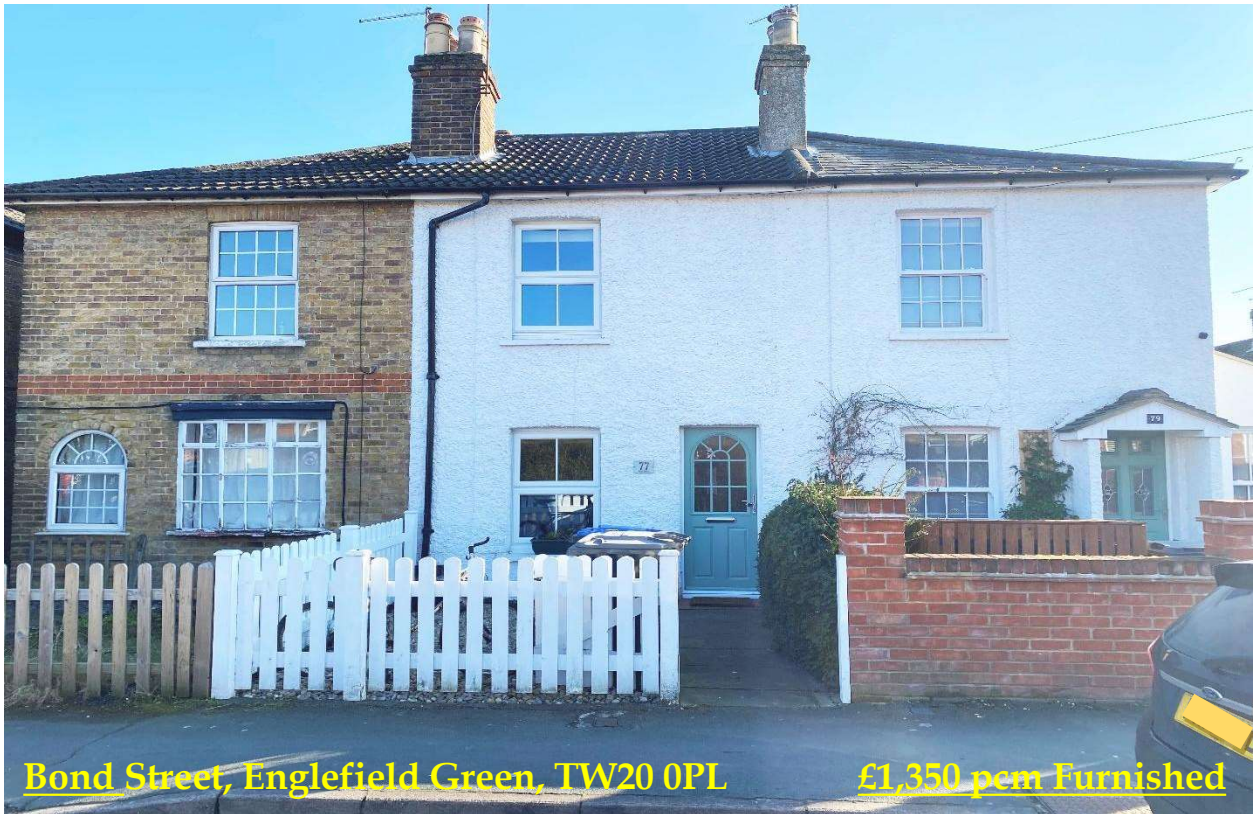
Bond Street, Englefield Green, TW20 0PL