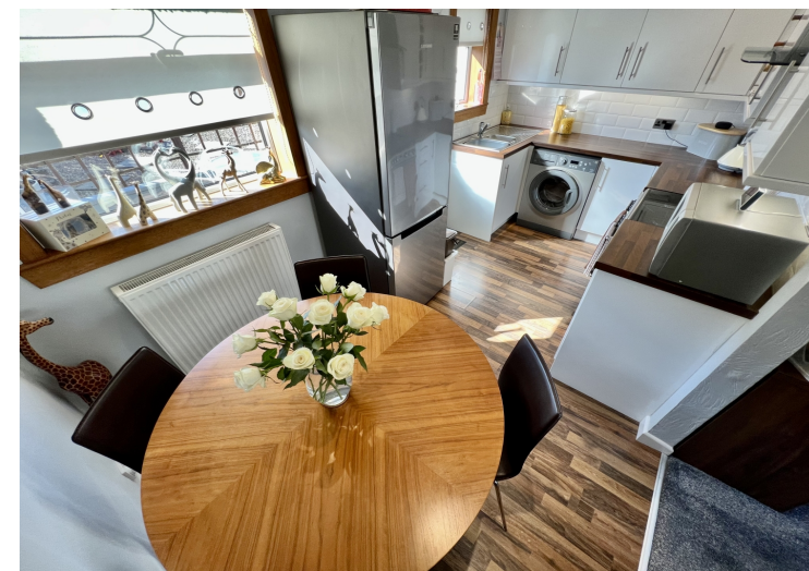
Nairn Court, Kilwinning