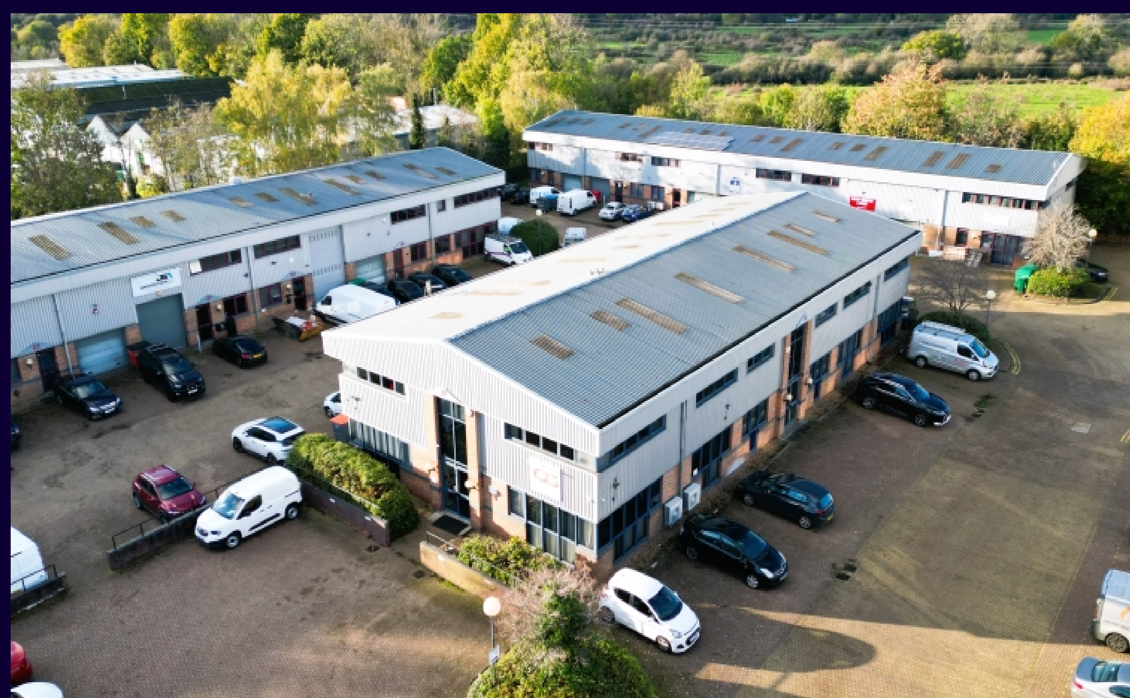
The Metro Centre, Watford, Hertfordshire, WD18 9SB