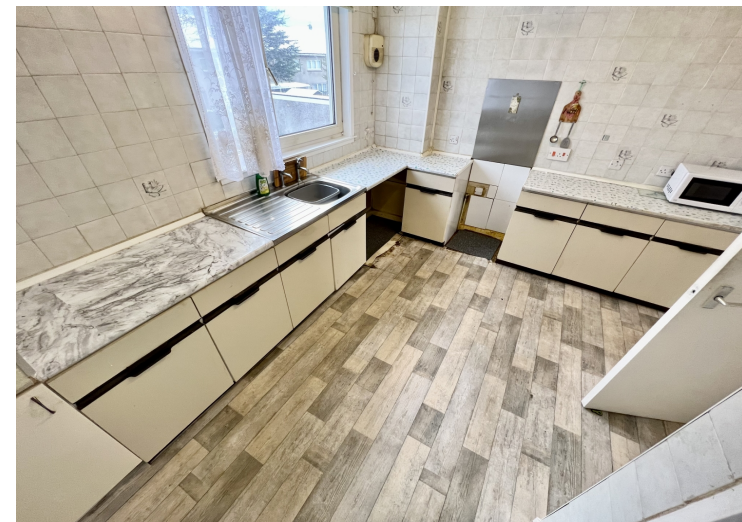
103 Braes Avenue, Clydebank