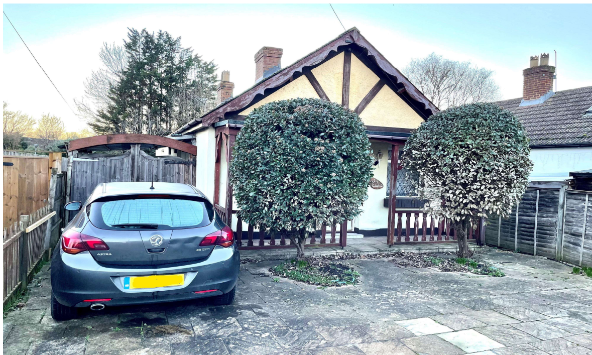
Pooley Green Road, Egham, TW20 8AL