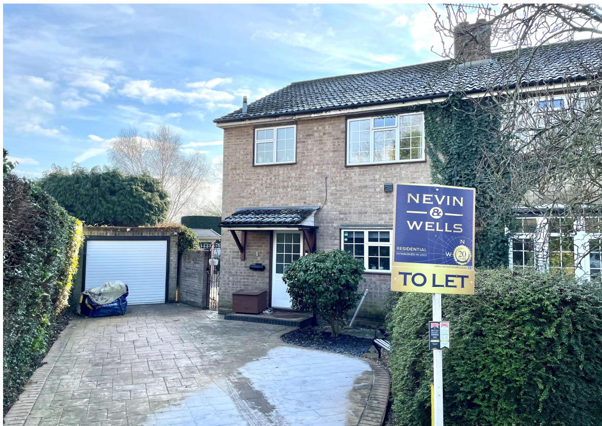
Berkeley Close, Moor Lane, TW19 6ED