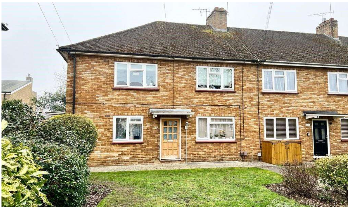
Cedar Court, Egham, TW20 9DB