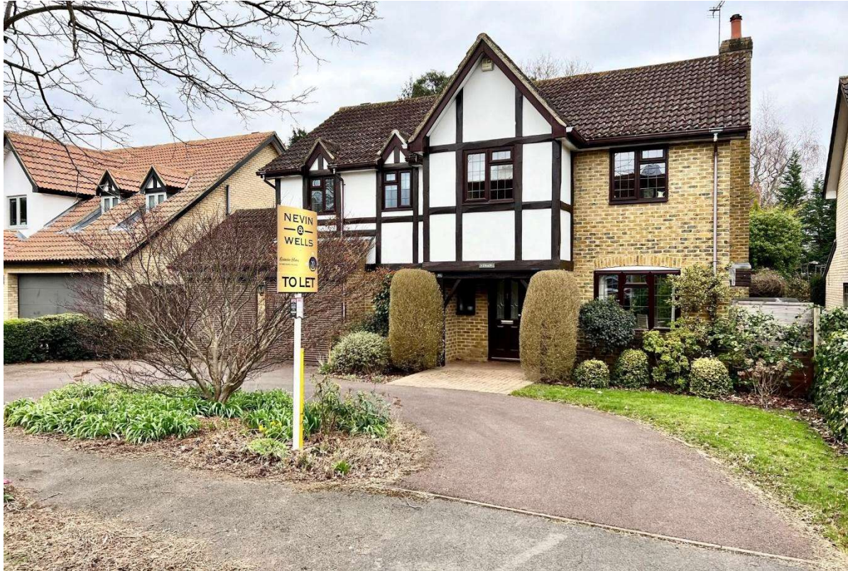
St Georges Road, Weybridge, KT13 0EP