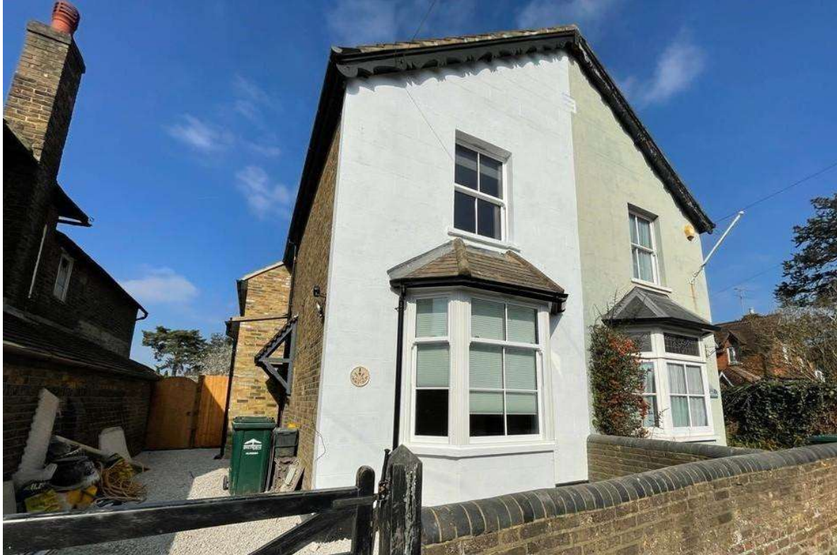
The Broadway, Laleham, TW18 1SB