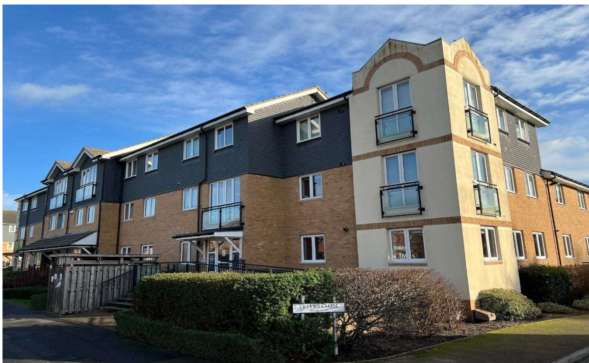
The Shires, Staines, TW18 3AD