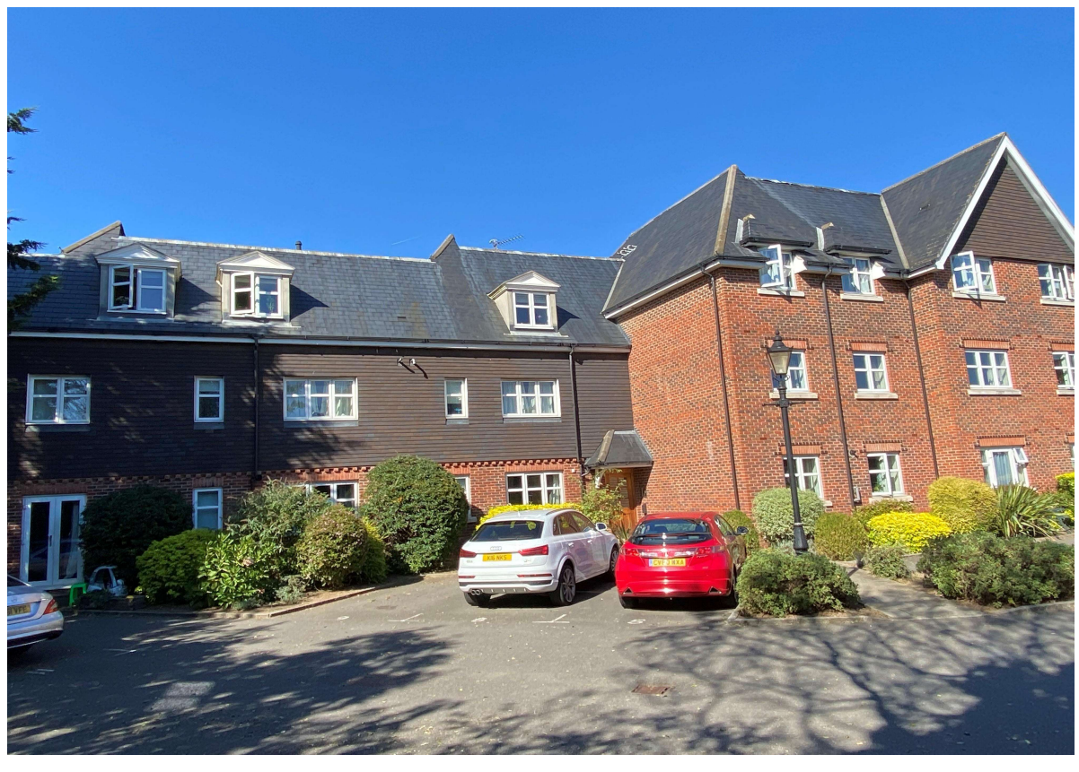
Albany Court, Egham, TW20 9GP