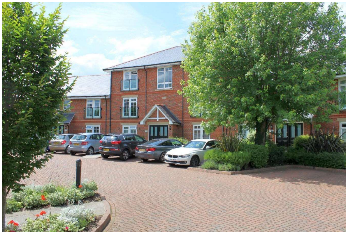
Wetton Place, Surrey, TW20 9ER