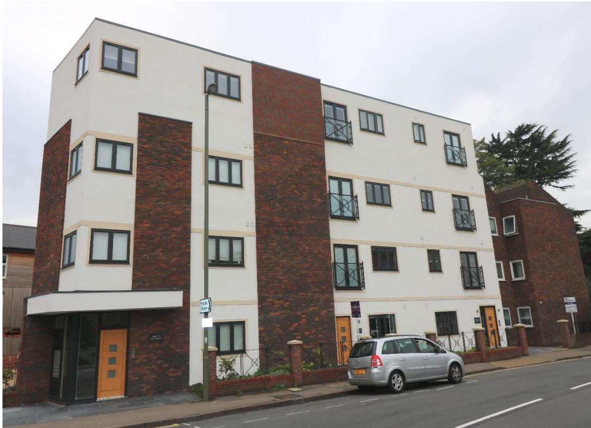
High Street, Egham, Surrey, TW20 9DY