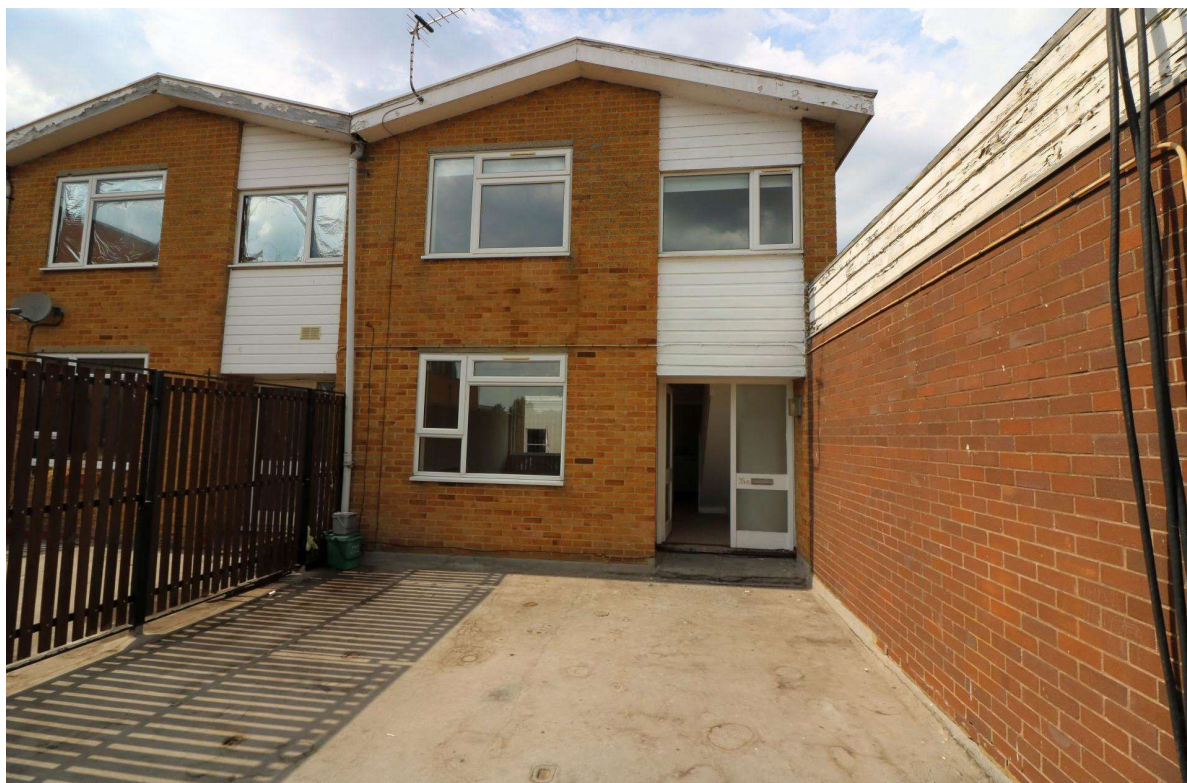
The Precinct, Surrey, TW20 9HN