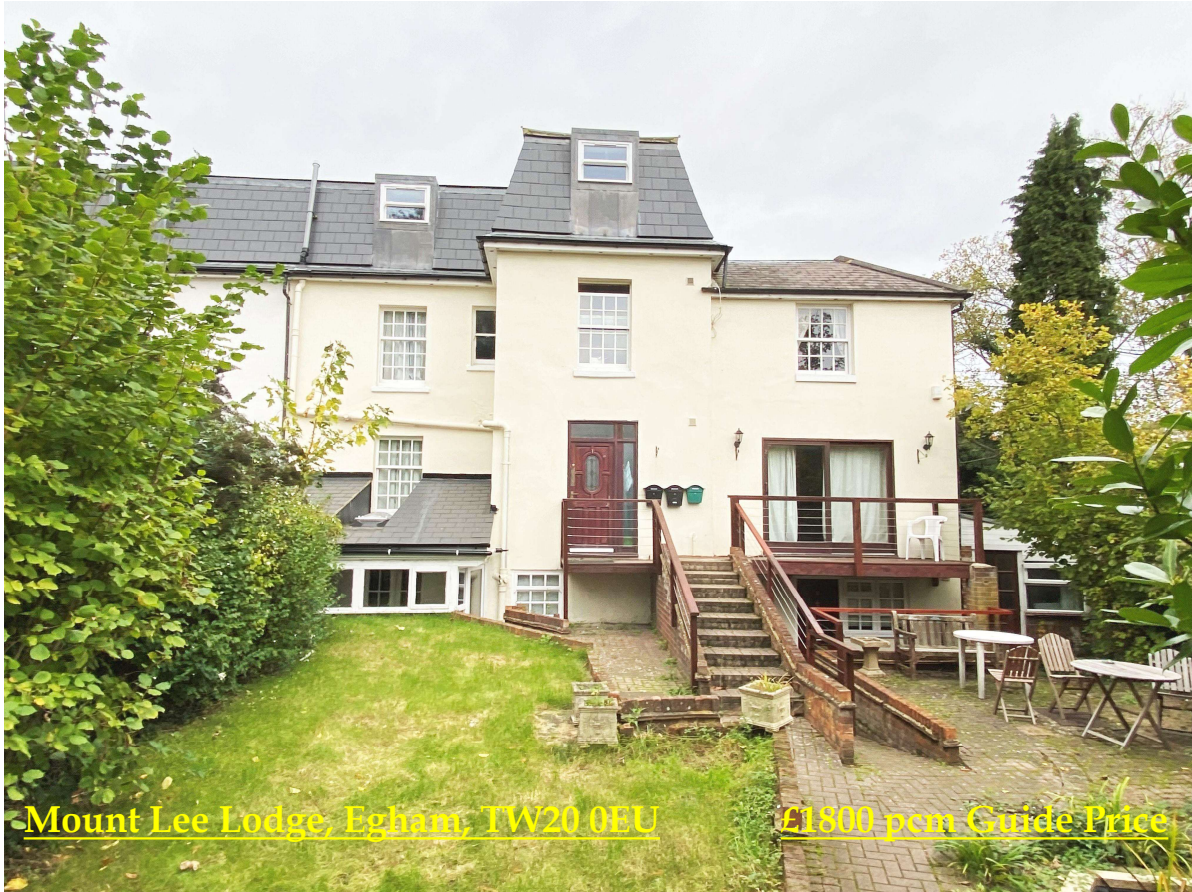
Mount Lee Lodge, Egham, TW20 0EU