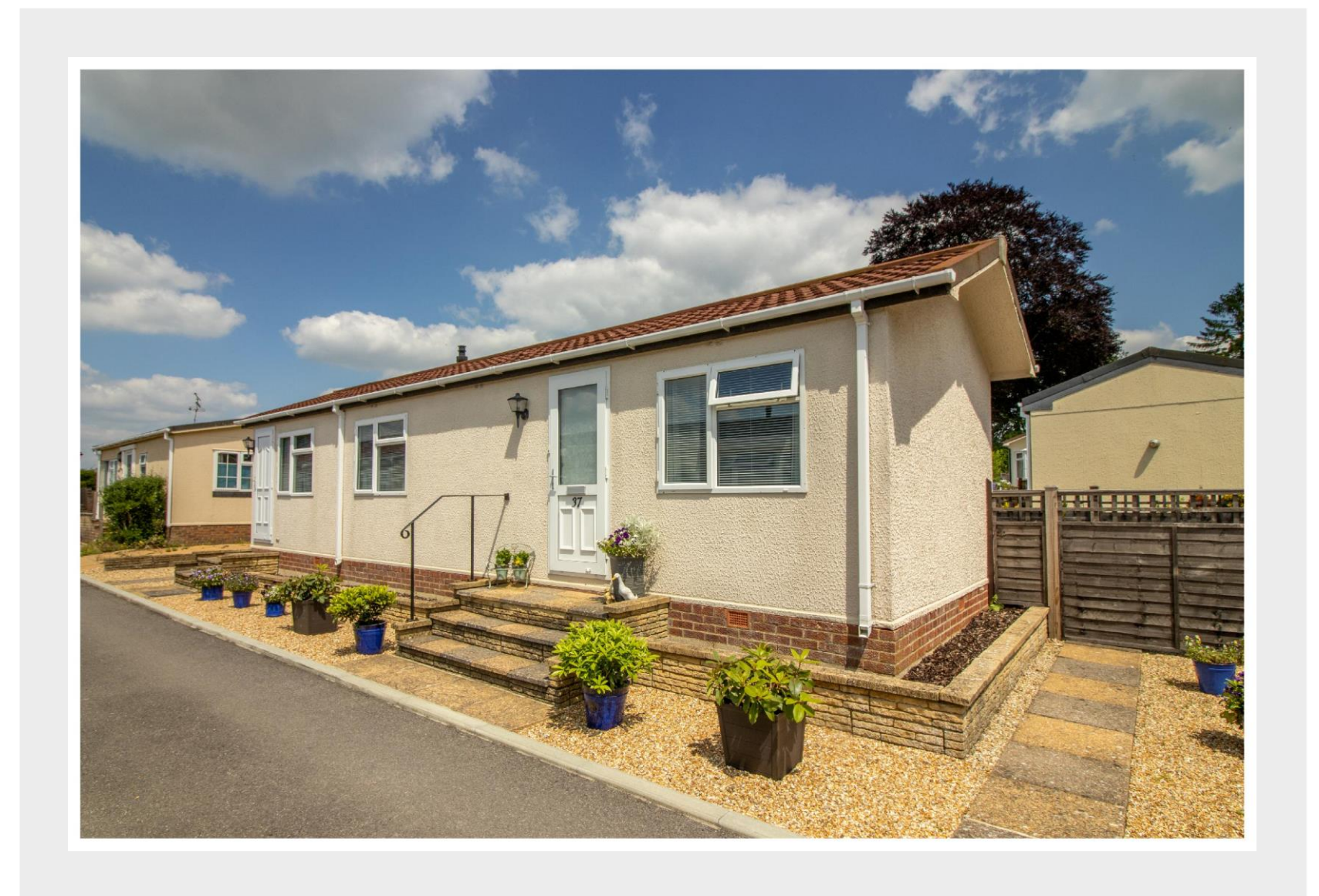
At home in Alresford