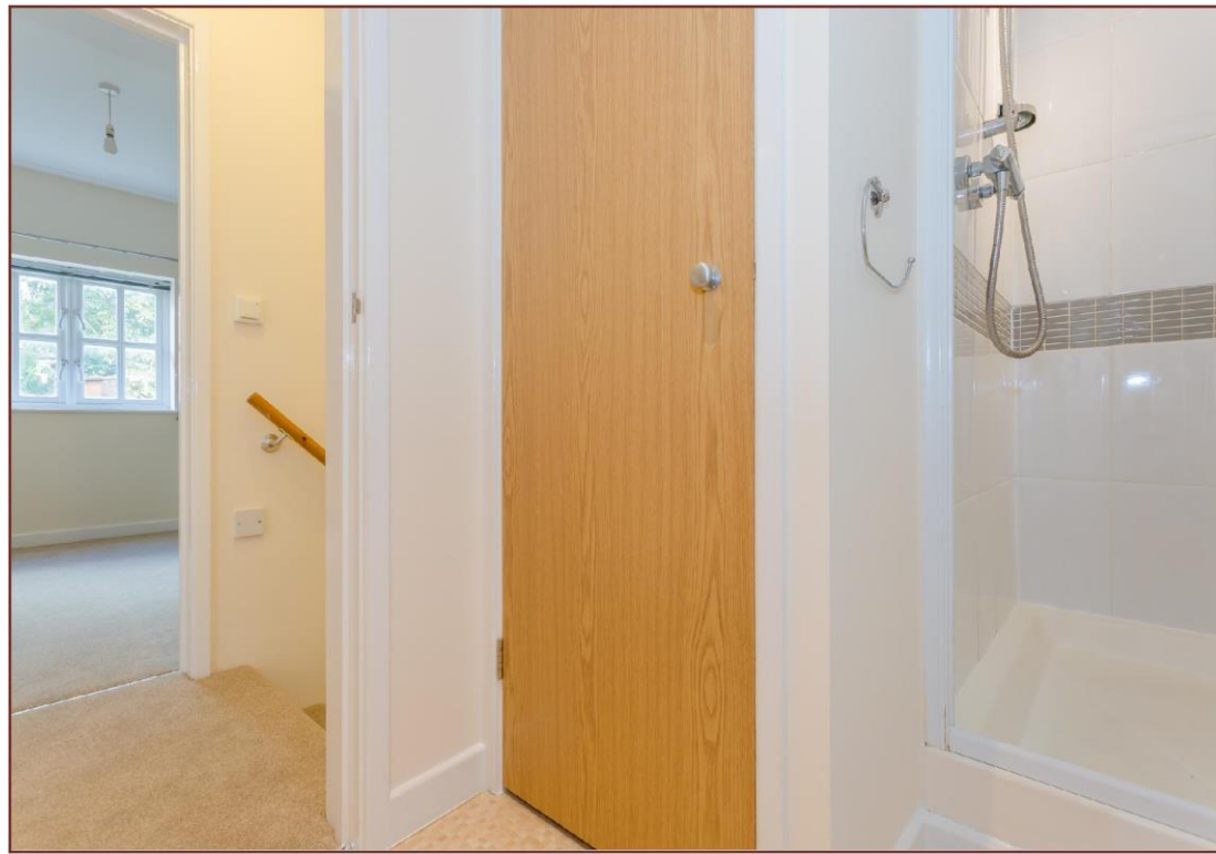
1ST FLOOR 437 sq.ft. (40.3 sq.m.) approx.