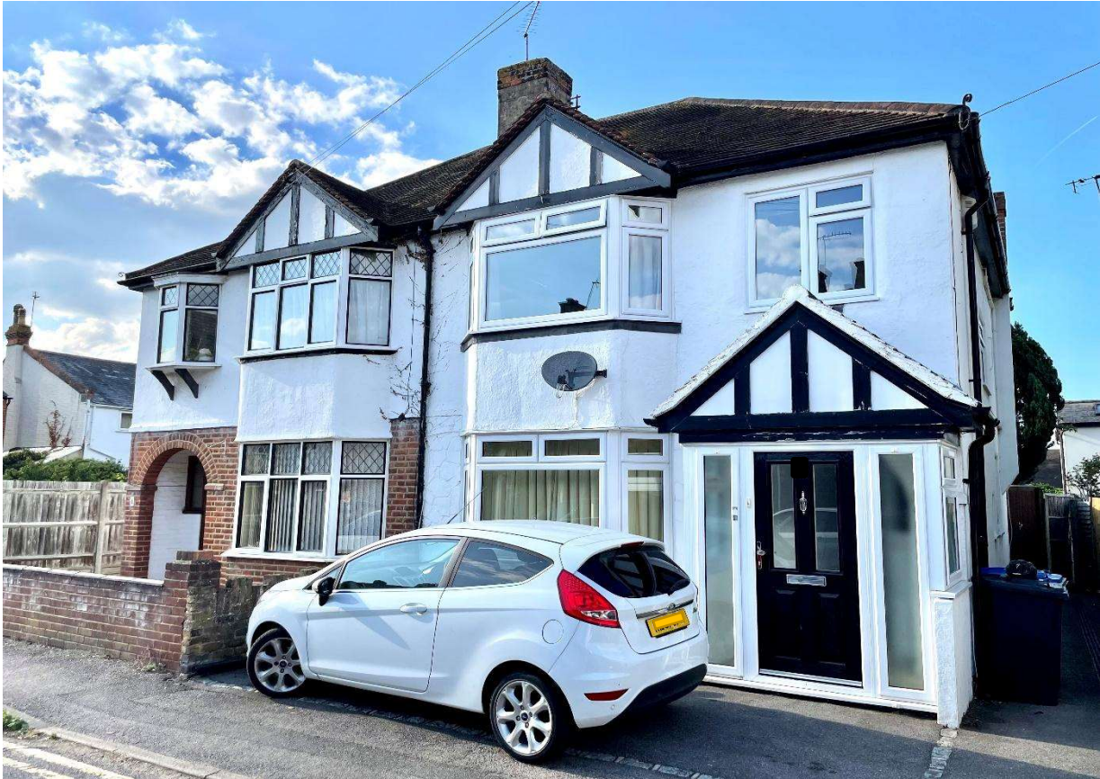
Crown Street, Egham, Surrey, TW20 9BH