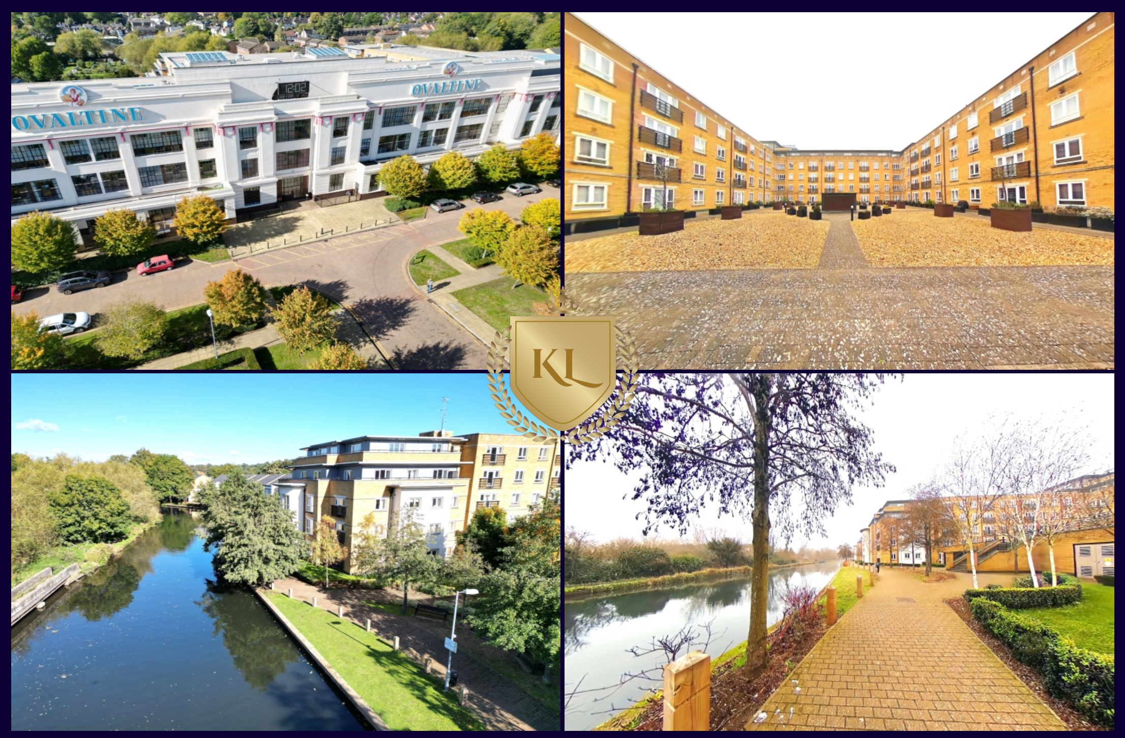
Kings Langley Estates wishes to inform prospective buyers and tenants that these particulars are a guide and act as information only. All our details are given in good faith and believed to be correct at the time of printing but they don't form part of an offer or contract. No employee of the company has authority to make or give and representation or warranty in relation to this property. All fixtures and fittings, whether fitted or not are deemed removable by the vendor unless stated otherwise and room sizes are measured between internal wall surfaces, including furnishings.