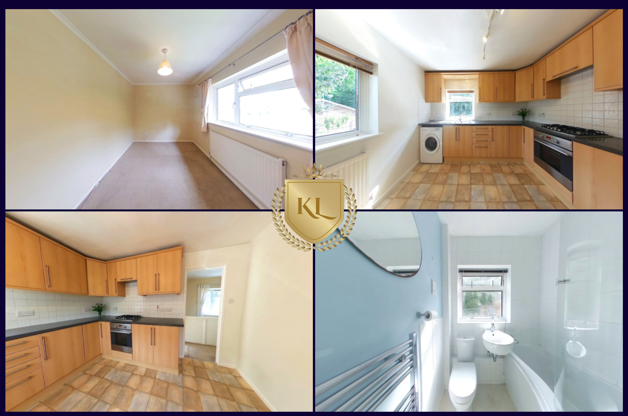
Kings Langley Estates wishes to inform prospective buyers and tenants that these particulars are a guide and act as information only. All our details are given in good faith and believed to be correct at the time of printing but they don't form part of an offer or contract. No employee of the company has authority to make or give and representation or warranty in relation to this property. All fixtures and fittings, whether fitted or not are deemed removable by the vendor unless stated otherwise and room sizes are measured between internal wall surfaces, including furnishings.