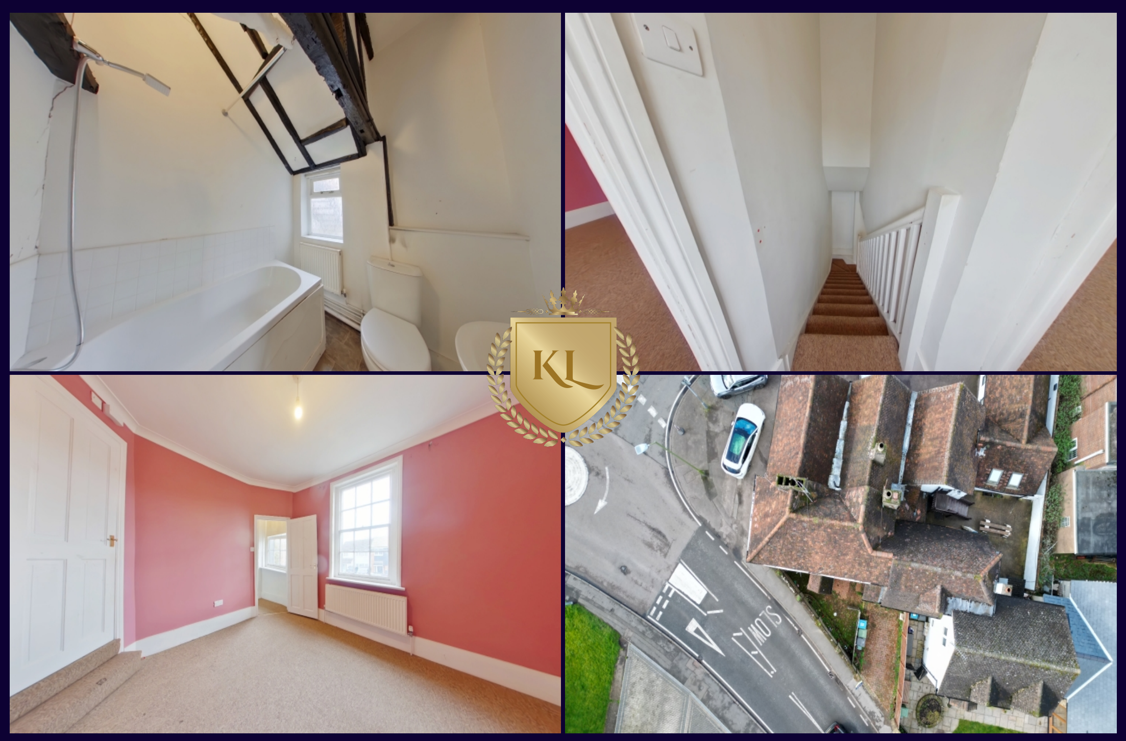
Kings Langley Estates wishes to inform prospective buyers and tenants that these particulars are a guide and act as information only. All our details are given in good faith and believed to be correct at the time of printing but they don't form part of an offer or contract. No employee of the company has authority to make or give and representation or warranty in relation to this property. All fixtures and fittings, whether fitted or not are deemed removable by the vendor unless stated otherwise and room sizes are measured between internal wall surfaces, including furnishings.