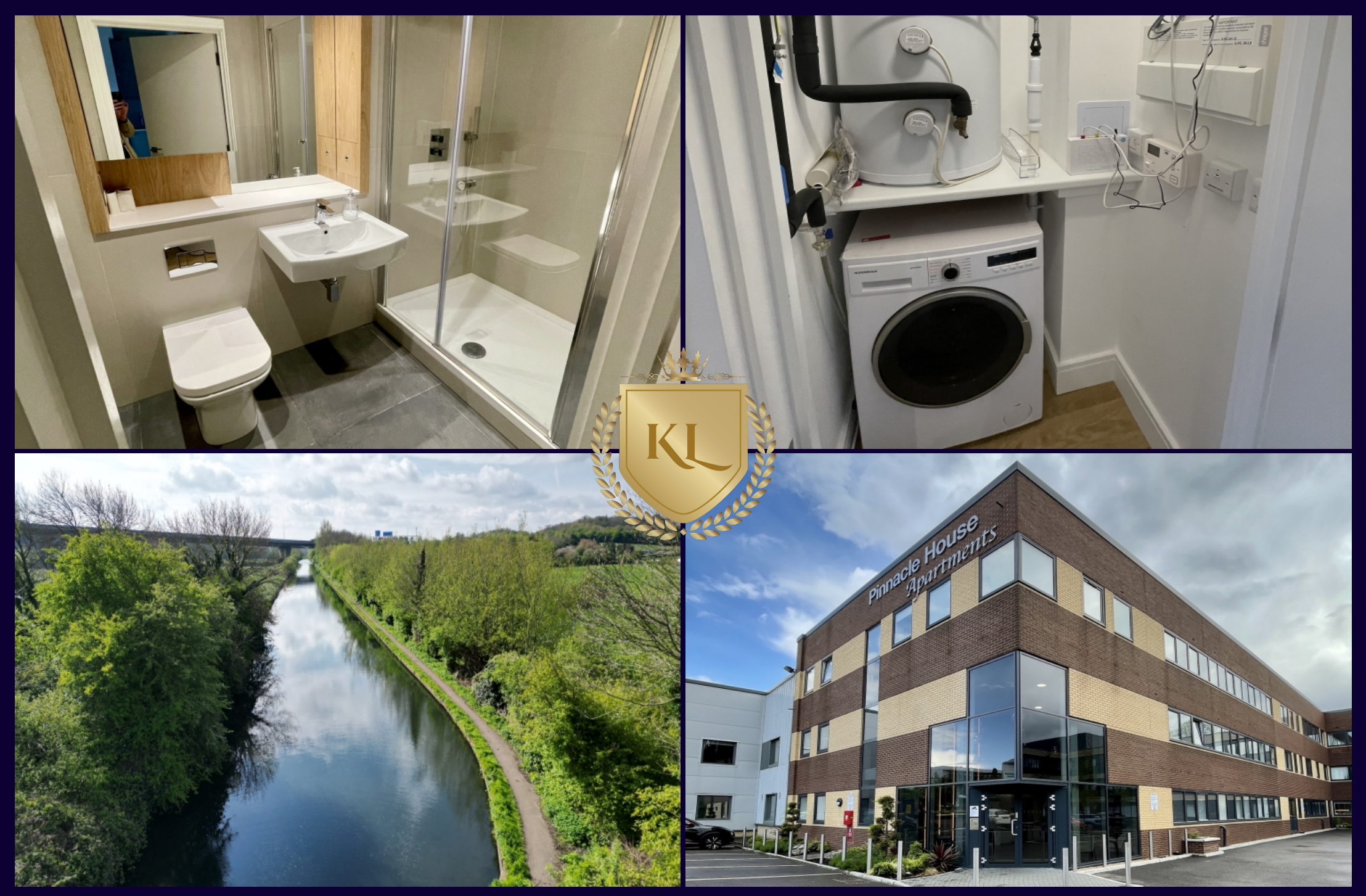
Kings Langley Estates wishes to inform prospective buyers and tenants that these particulars are a guide and act as information only. All our details are given in good faith and believed to be correct at the time of printing but they don't form part of an offer or contract. No employee of the company has authority to make or give and representation or warranty in relation to this property. All fixtures and fittings, whether fitted or not are deemed removable by the vendor unless stated otherwise and room sizes are measured between internal wall surfaces, including furnishings.