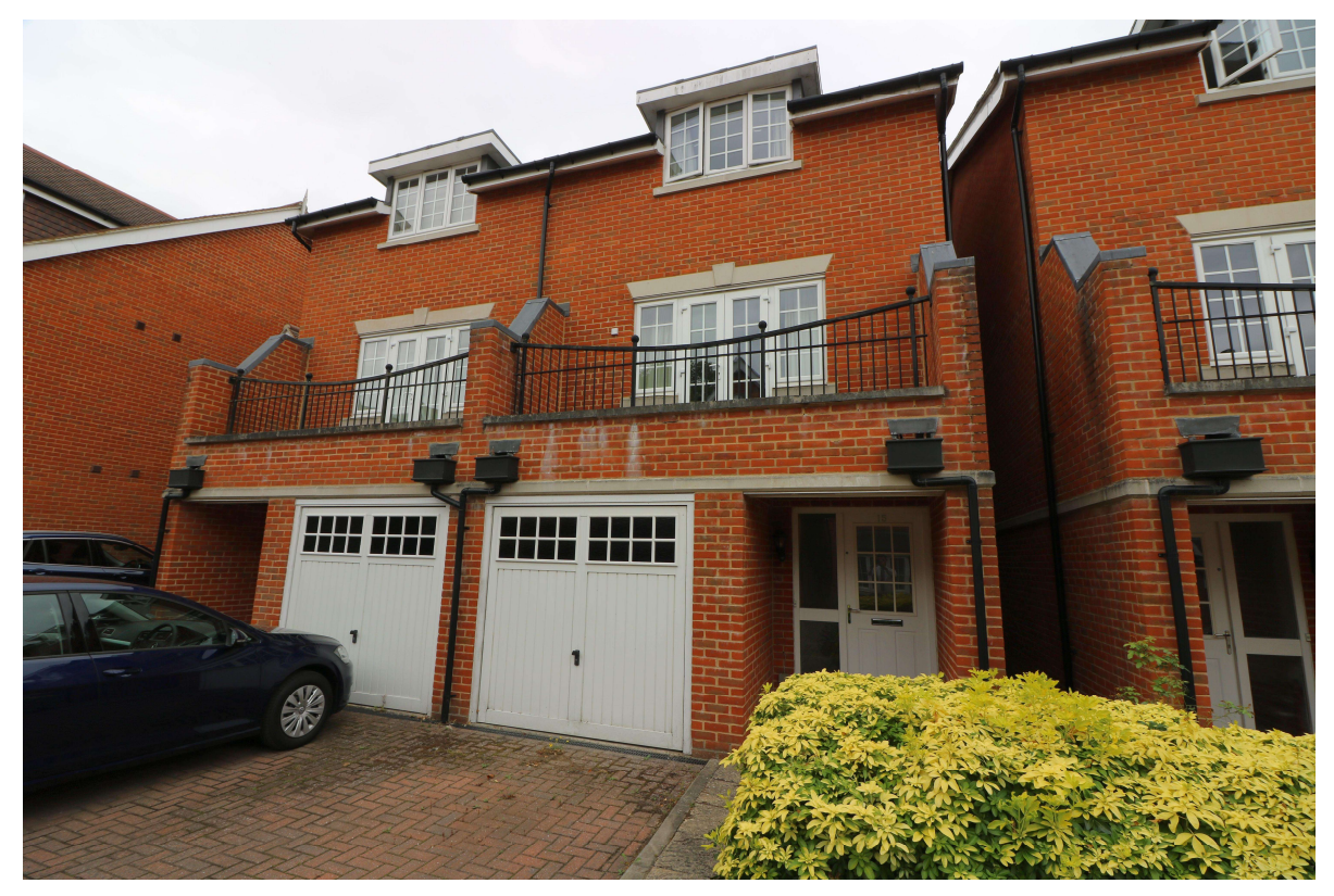
Brackendale Close, Surrey, TW20 0UL