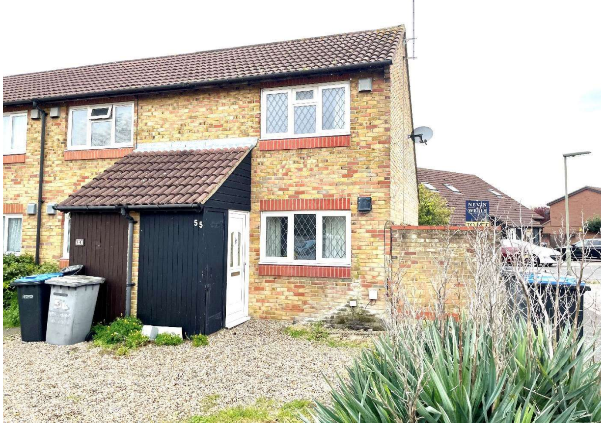
Alexander Road, Egham, TW20 8AE