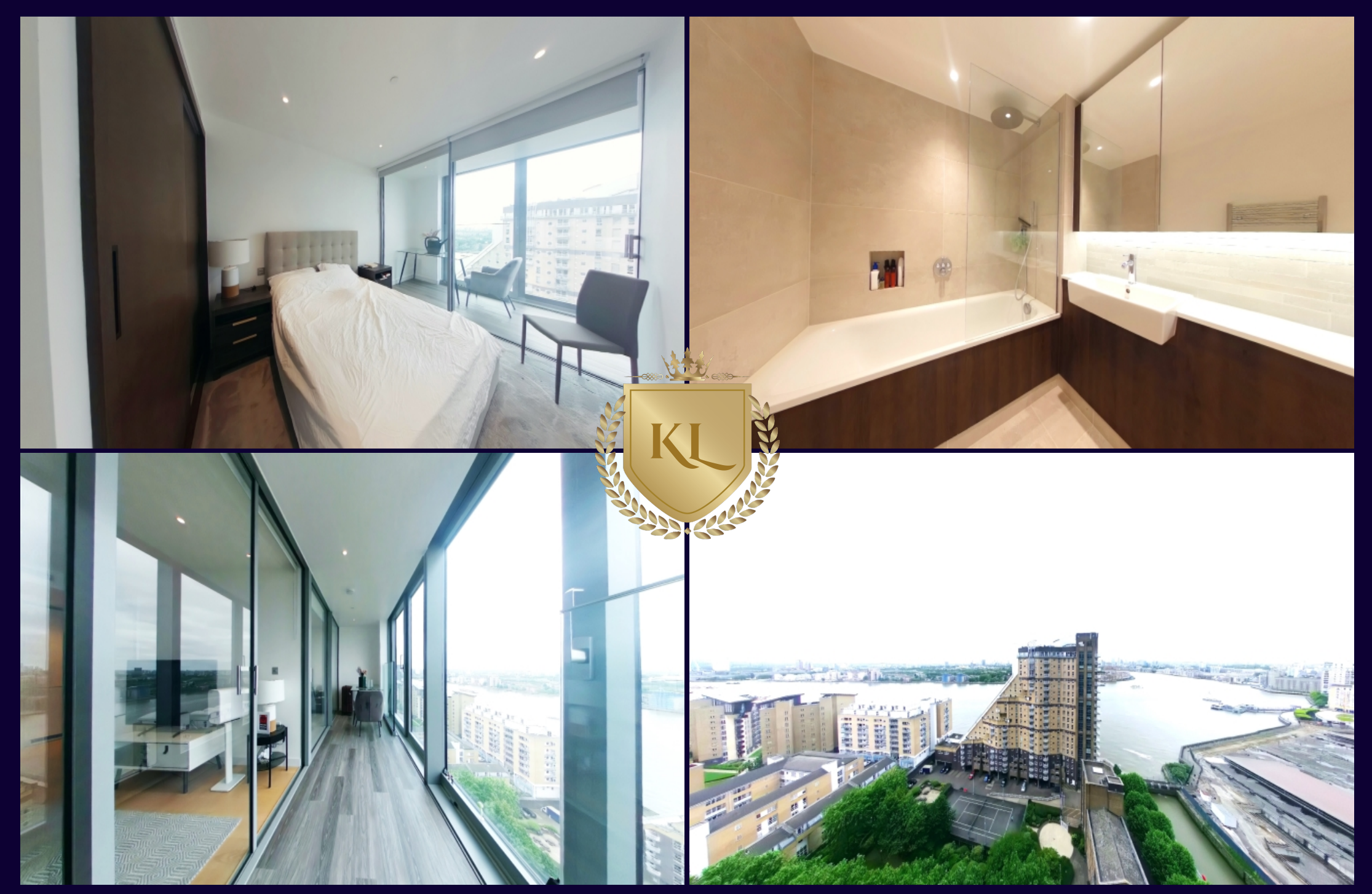
Kings Langley Estates wishes to inform prospective buyers and tenants that these particulars are a guide and act as information only. All our details are given in good faith and believed to be correct at the time of printing but they don't form part of an offer or contract. No employee of the company has authority to make or give and representation or warranty in relation to this property. All fixtures and fittings, whether fitted or not are deemed removable by the vendor unless stated otherwise and room sizes are measured between internal wall surfaces, including furnishings.