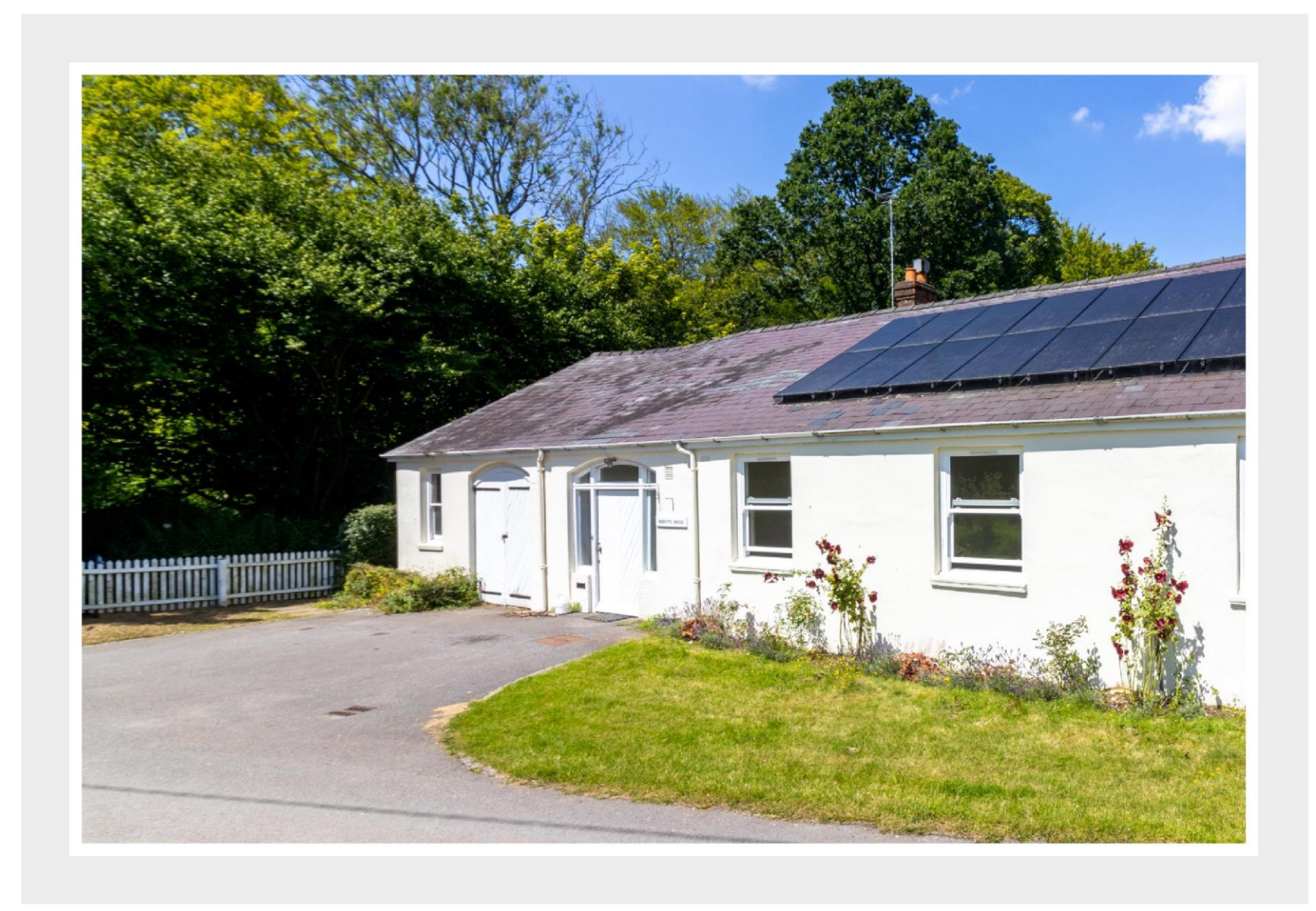
At home in Swarraton