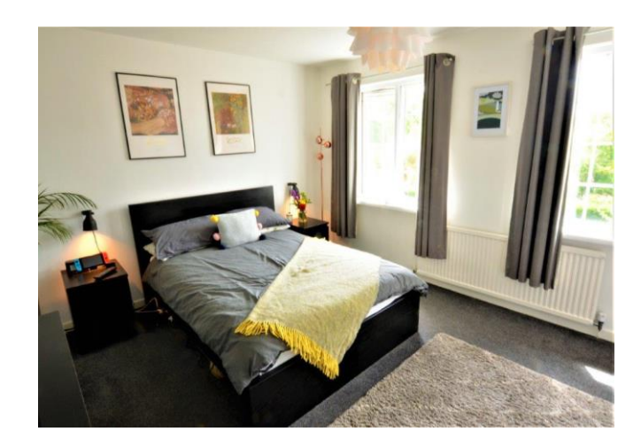
Along the corridor is the second bedroom 3.59m \times 4.08m . This is a spacious and airy rear facing bedroom with large built-in wardrobes.