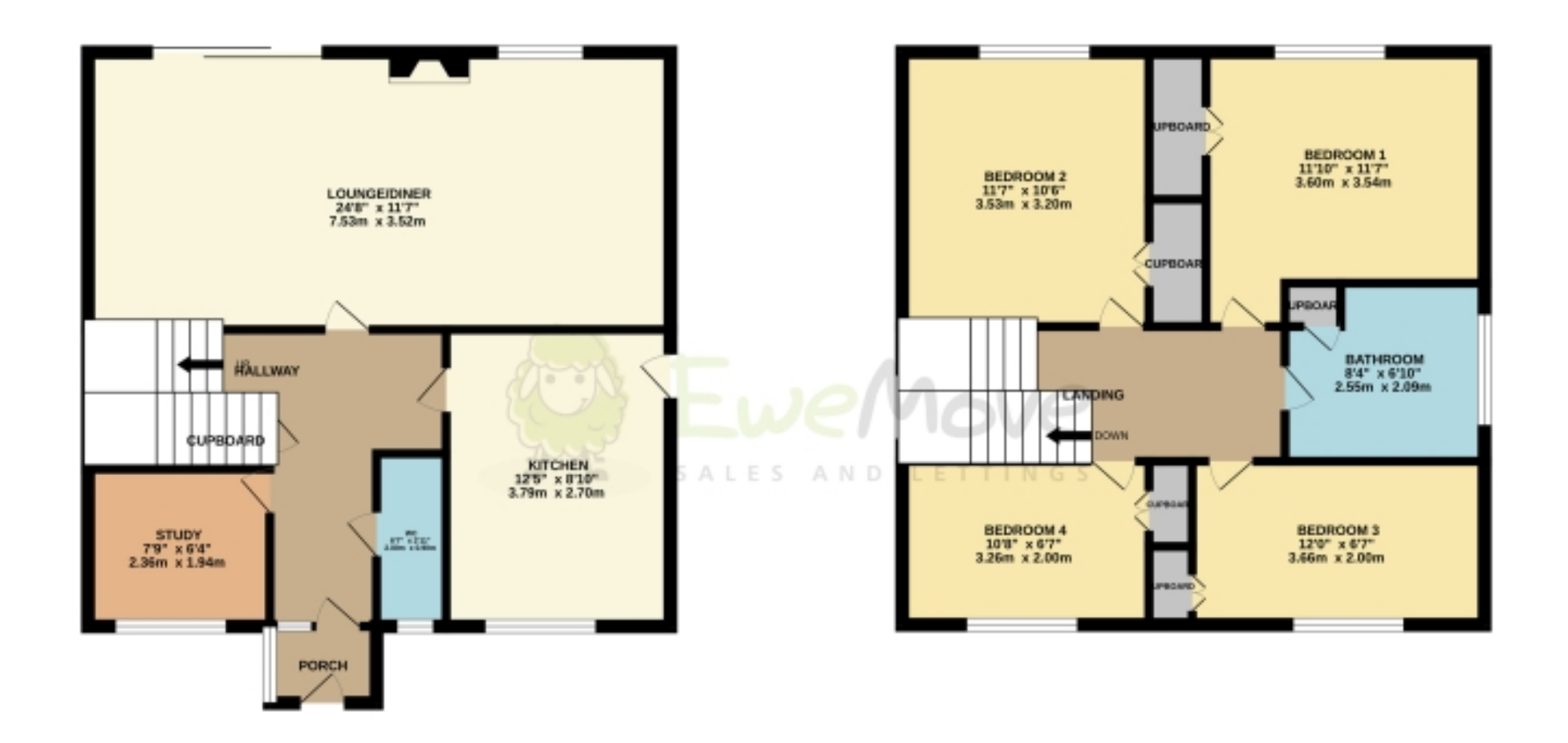
1ST FLOOR 599 sq.ft. (55.6 sq.m.) approx.

GROUND FLOOR 612 sq.ft. (56.8 sq.m.) approx.