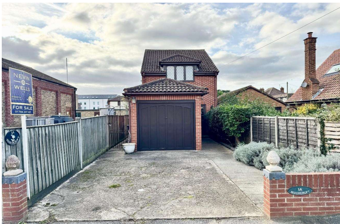
Runnemeade Road, Egham, Surrey, TW20 9BT