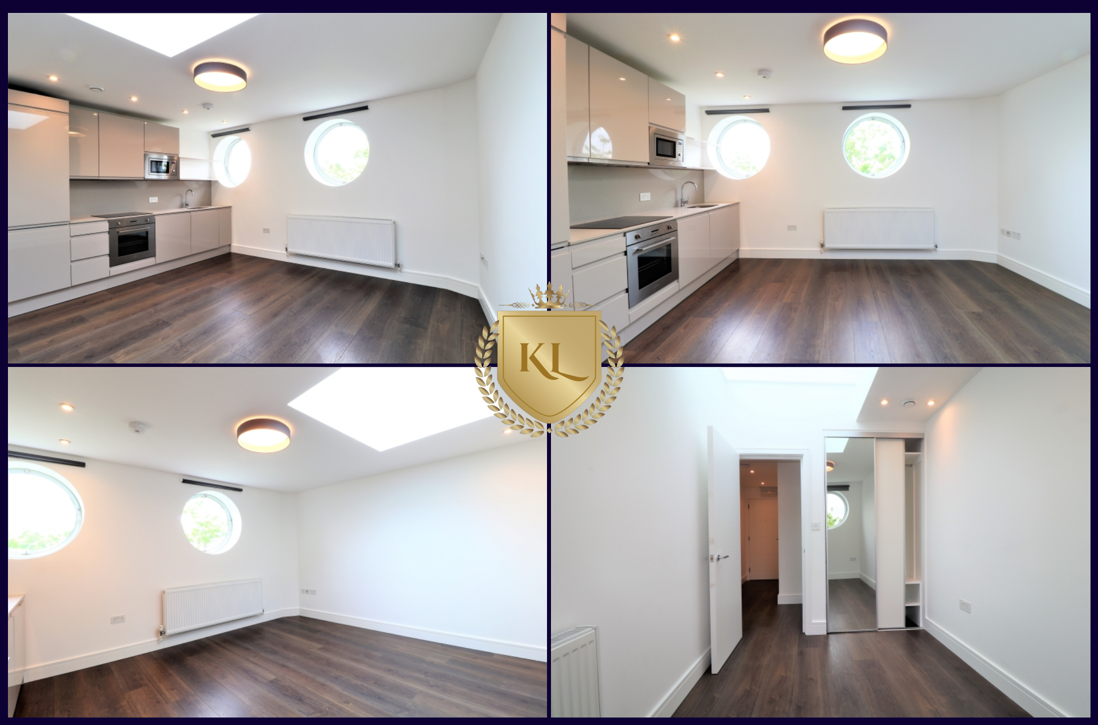
Kings Langley Estates wishes to inform prospective buyers and tenants that these particulars are a guide and act as information only. All our details are given in good faith and believed to be correct at the time of printing but they don't form part of an offer or contract. No employee of the company has authority to make or give and representation or warranty in relation to this property. All fixtures and fittings, whether fitted or not are deemed removable by the vendor unless stated otherwise and room sizes are measured between internal wall surfaces, including furnishings.