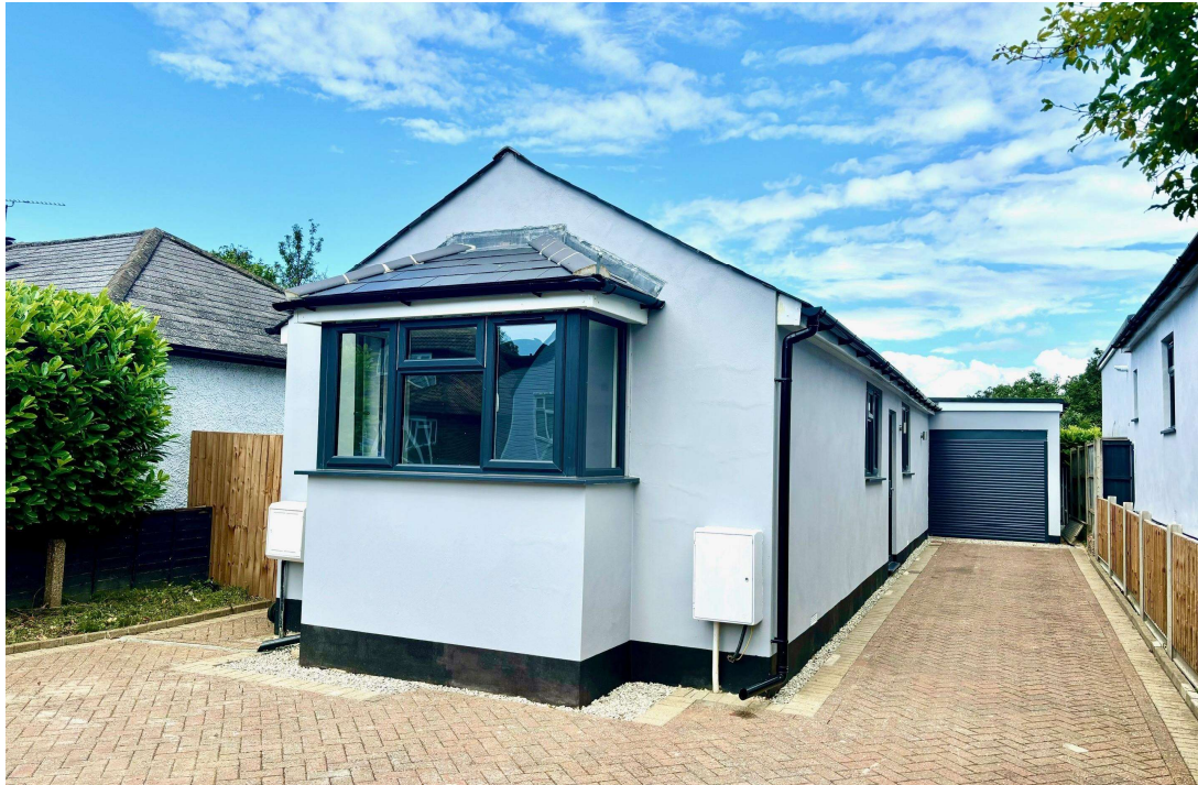
Ayebridges Avenue, Egham, TW20 8HR £480,000 Freehold