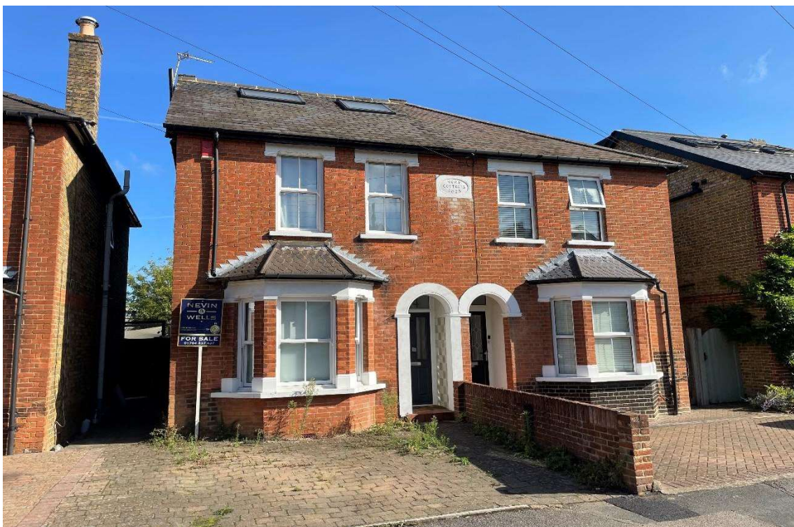
Osborne Road, Egham, Surrey, TW20 9RN