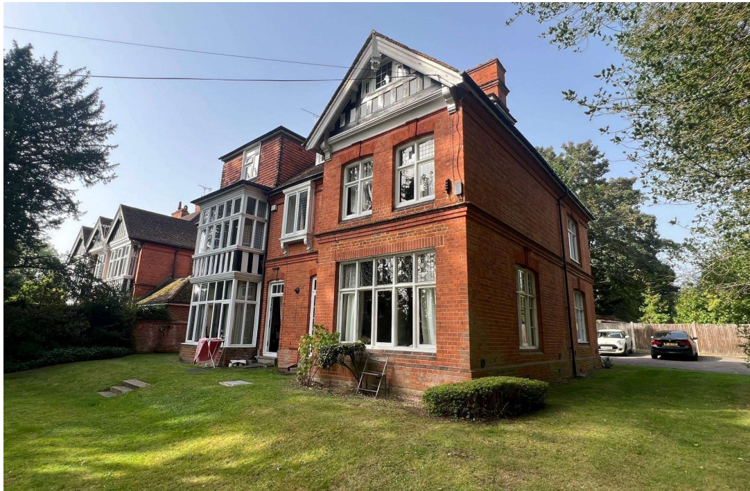
Kinburn Drive, Egham, Surrey, TW20 0BD