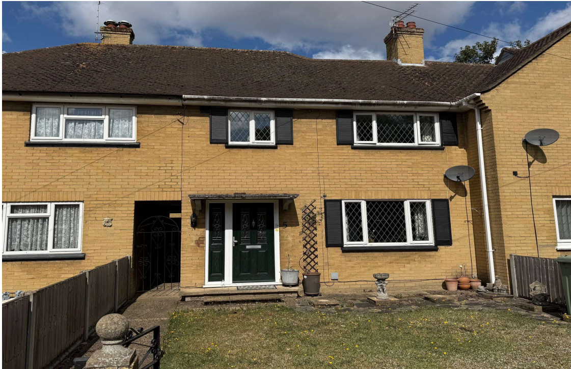
Wendover Place, Staines, TW18 3DG