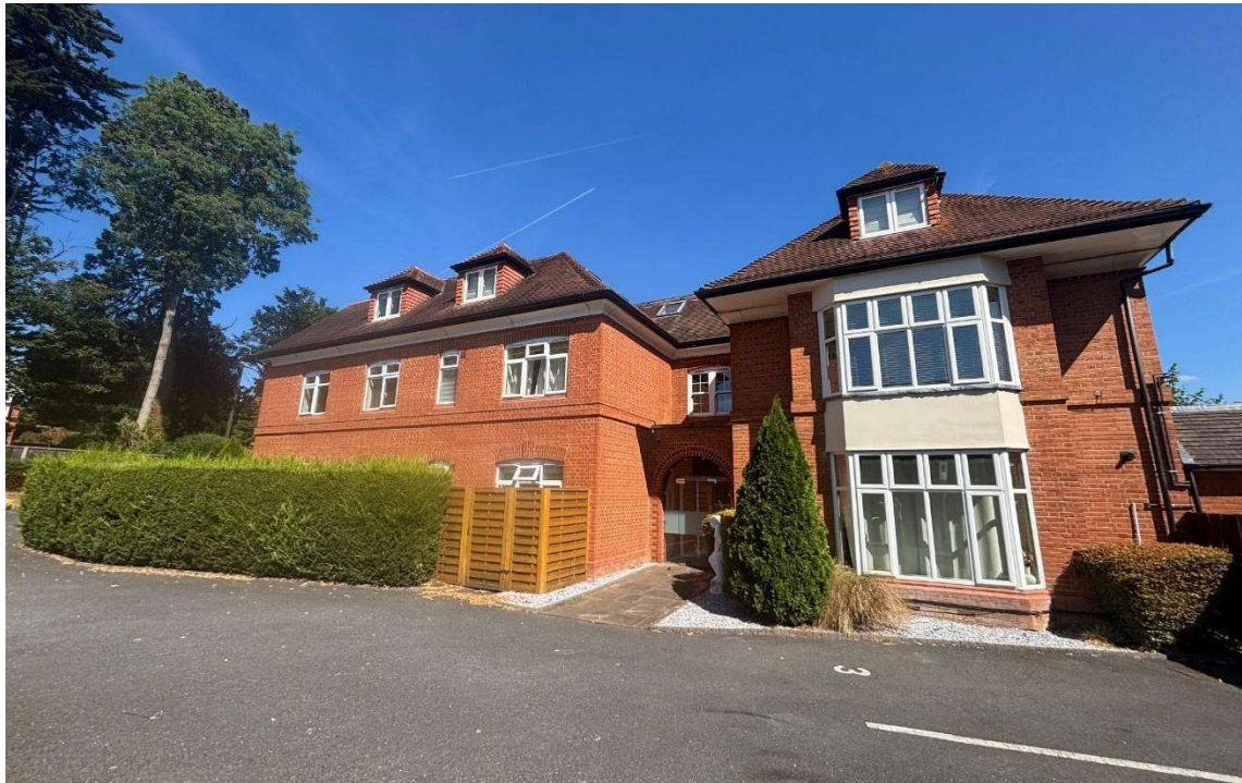
Northdene Court, Egham Hill, TW20 0AL