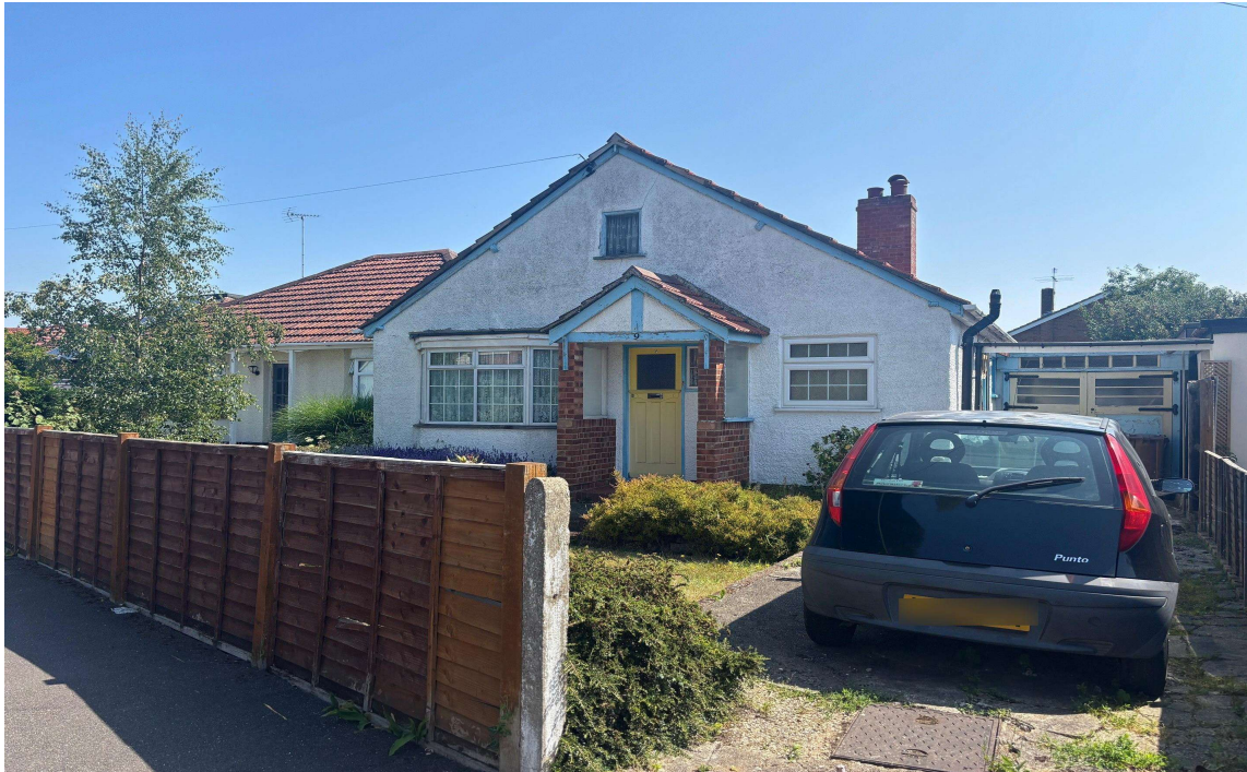
Avondale Avenue, Staines, TW18 2PT