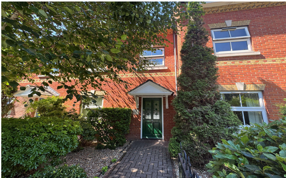
Victoria Mews, Englefield Green, TW20 0BF