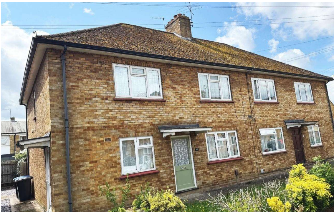
Crown Street, Egham, Surrey, TW20 9DB