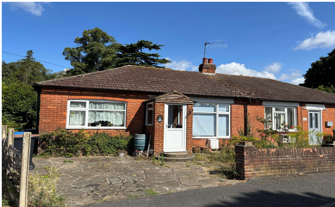
Vegal Crescent, Englefield Green, TW20 0QF