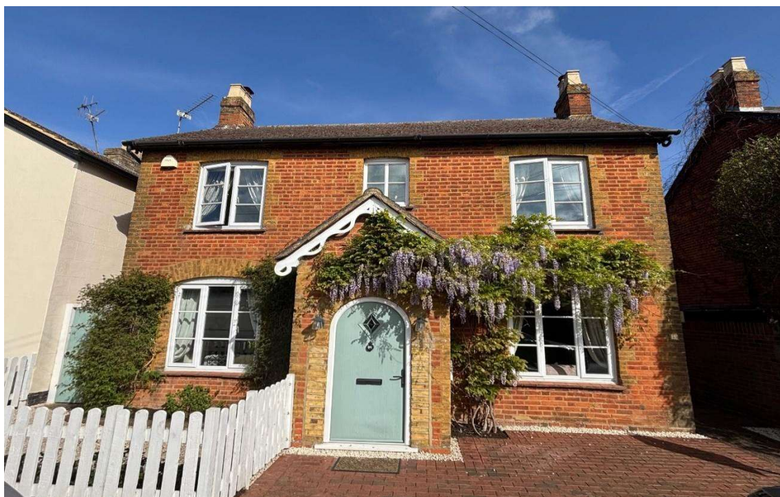
Crown Street, Egham, Surrey, TW20 9BZ