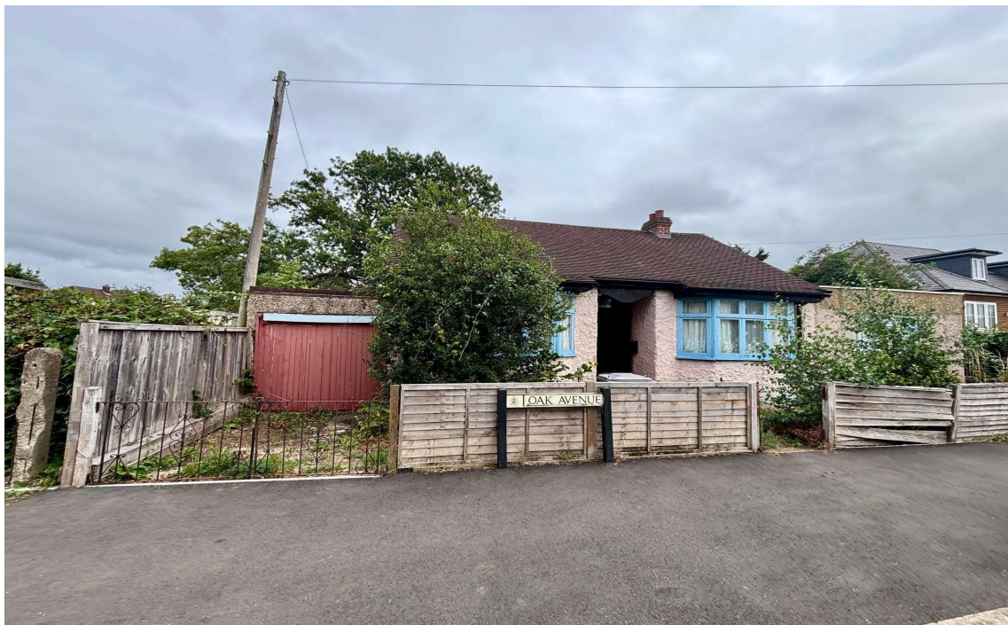
Oak Avenue, Egham, TW20 8HH